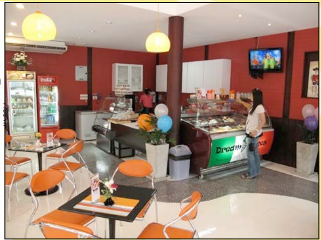
A typical shop floor plan showing a layout designed by us to sell ice cream and pastry, light food, coffee, slush, crepes, ice cream cakes and rolls, soft drinks, milk shakes and custards

Onsite Setup fee: Any startup can be stressful and our staff is available to be on site during the week of startup. When we leave your staff is trained, the machines are all working and the freezers are full of ice cream.