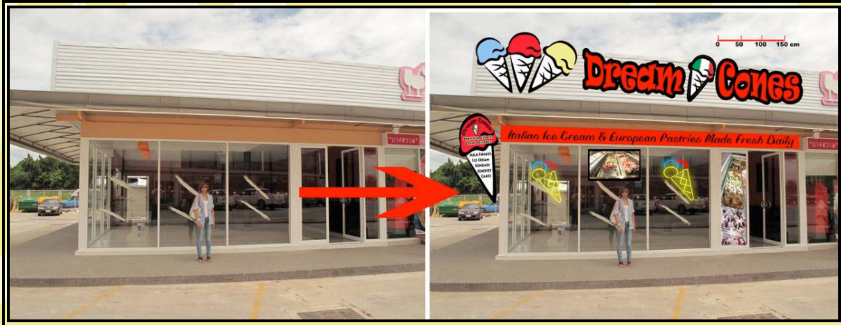
Typical startup from raw space.