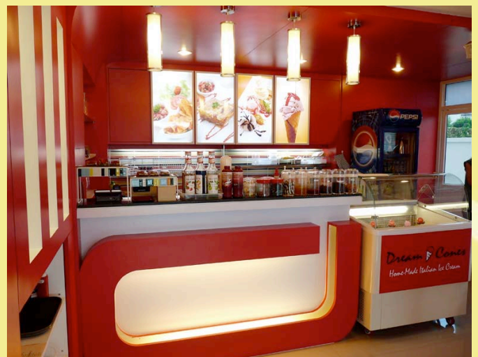
This 50 sq. meter shop offers ice cream, ice cream cakes and rolls, cakes, cookies, coffee and pastry, an 8-item light food menu plus a variety of drinks. Eight tables (not shown) are on the right.

Being a successful ice cream entrepreneur can be profitable, exciting and challenging. People never stop telling you how much they love your ice cream. But, it is a technical business and not easy to start on your own. Join the family! Become a Dream Cones franchisee!