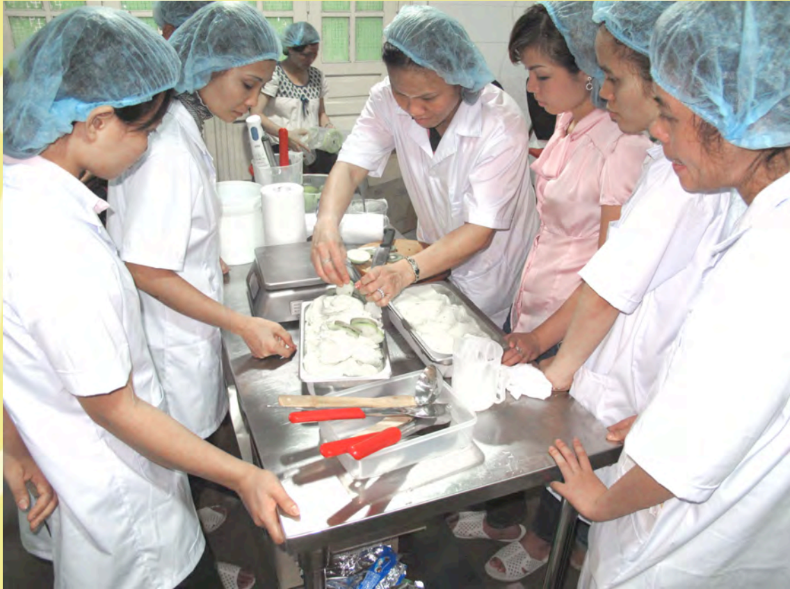
Adding decorative border