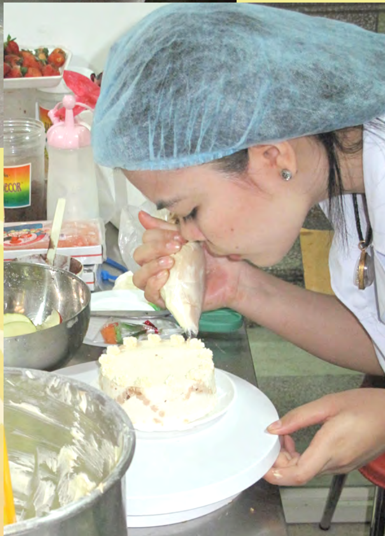
RIGHT: Decorating using pastry sleeve