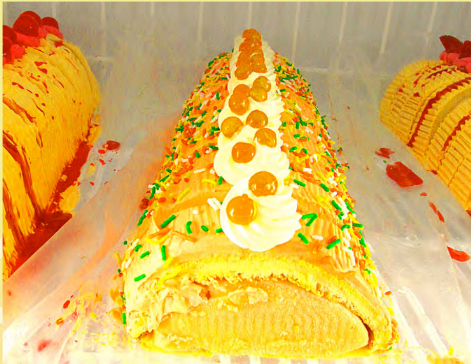
Luscious ice cream roll