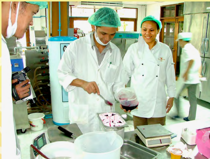
Big Boss supervising a trainee in the decoration of gelato

The training course text you will use is our eBook, Gelato Maker's Guide, Ice Cream Dream and Ice Cream Business Startup Kit Guide by Michael Greenwald and other files specified below. These eTexts will be provided as part of the course.