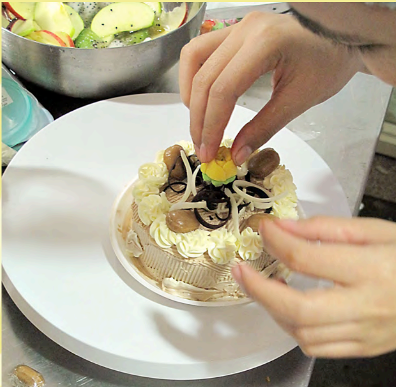
ABOVE: Placing meringue flower