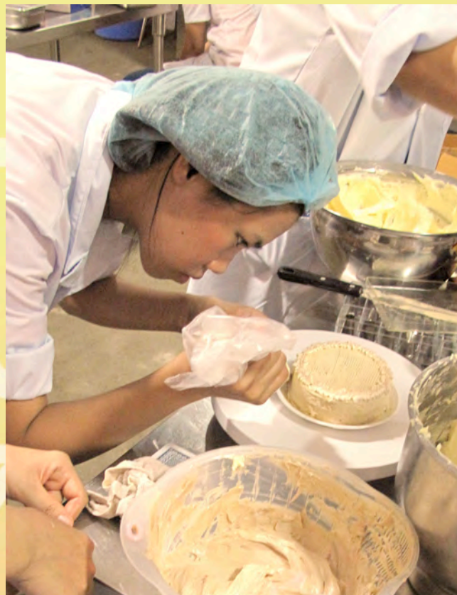
Student making training cake