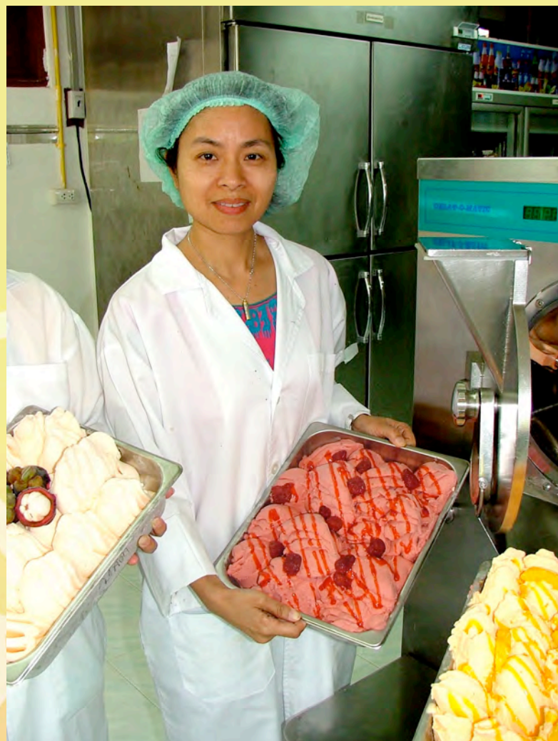
Student with large tray of sorbet